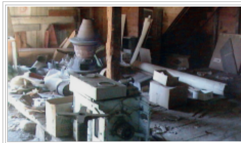
One of many piles of clutter in the rooms of the tavern and blacksmith shop.

The Tuttle Construction Company of Greenwich, New York was awarded the first contract to begin the restoration of the building. They have completed the restoration of sections of the foundation, including an outside cellar entrance, strengthening the roof beams, and removing a small 1920s addition from the Grooms Road side of the building. This was done with part of the $116,000 provided by the Town last summer.